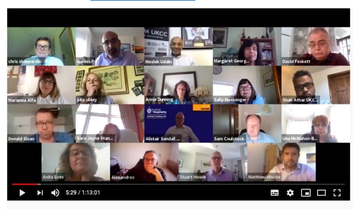
Hospitality Education discussion forum - is it time for a radical rethink?

For the full session visit: <a href="https://youtu.be/cXVspswjSnk">https://youtu.be/cXVspswjSnk</a>